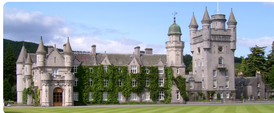
Balmoral Castle is in Aberdeenshire, Scotland. It is used mainly as a holiday home for the Royal Family.