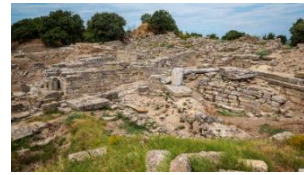
Ruins of Troy