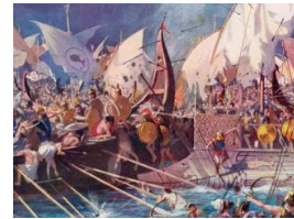
Ancient Greek Society